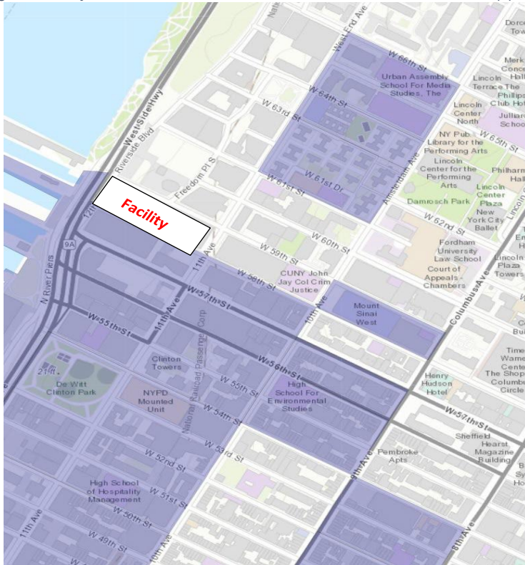
Figure 1. Project Location and Potential Environmental Justice Area(s) in blue shade

The objective of this PPP is to outline and describe the program of activities that the applicant will implement to actively seek and enhance public participation during the application review process.