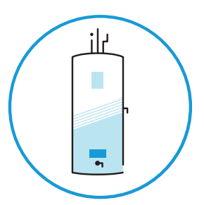
Hot Water System