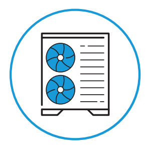
Heating, Cooling, Ventilation (HVAC)