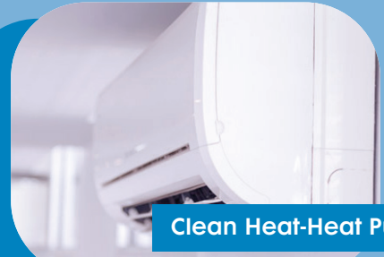
Clean Heat-Heat Pumps