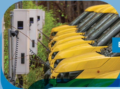
Electric Vehicle Programs

Review available Electrification Information on conEd.com as follows: