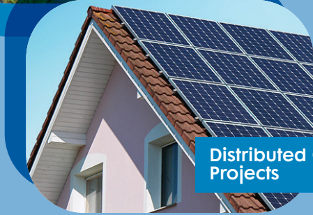
Distributed Generation Projects